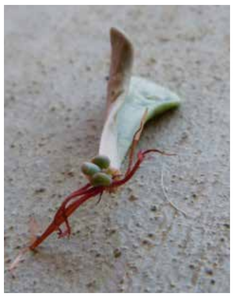
This leaf had fallen to the ground and sprouted roots and a plantlet without any human assistance. That's how easy it is to propagate succulents from leaf cuttings!

Article and Photos by Elaine Applebaum, Placer County Master Gardener