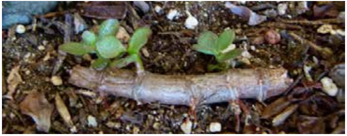
A cut stem from Crassula ovata, (jade plant) laid horizontally on cactus mix has sprouted roots and shoots.

Now that you know how easy it is to propagate succulents, grow your own to use in all those clever projects you've seen in magazines and on the internet. And be sure to grow a few to give to friends. You never know when they might have that new must-have variety to share with you!