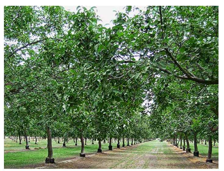
English walnut trees, such as those in the California orchard pictured above, also produce juglone, but in smaller amounts than black walnut. For more information on walnut allelopathy and lists of sensitive and tolerant plants, click here.

What if you already have a black walnut tree? Increasing soil drainage by adding organic amendment will decrease sensitivity problems. Diligently removing tree debris under the canopy will be helpful too. A vegetable garden should be located far away from the roots of the black walnut tree. It certainly depends on your garden situation if a black walnut tree will be friend or foe.