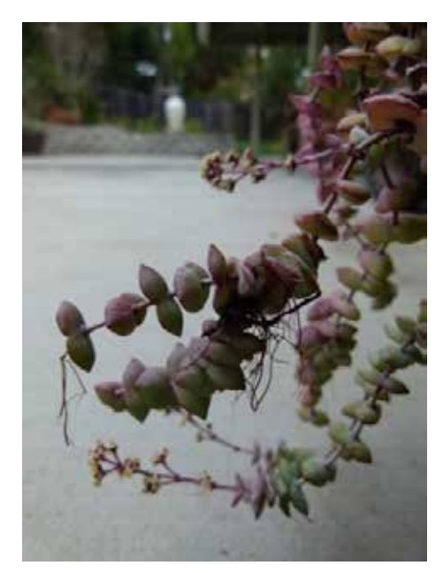
Spreading species such as Sedum often produce adventitious roots on above ground stems as in the picture above. Simply cut segments of stem with roots attached and place them in potting medium after the cut has had a chance to dry.

Maybe because they are drought tolerant or maybe because they can be used in so many creative ways, succulents seem to be incredibly popular these days. Equally comfortable in containers or well-drained landscapes, they are easy to grow and the assortment of colors and forms available is staggering. Those of us with serious plant lust can always find new "must-have" varieties to add to our collections. And once we have a variety, it is easy to produce multiple offspring to share or trade with friends. New plants can be generated from individual leaves, sections of stem, or rosette clusters cut from the parent plant.