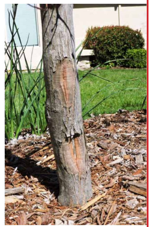
Sunburn damage on Japanese maple trunk.

Do you have gardening questions? Call the Master Gardener Hotline in your county Nevada Co. 530-273-0919 Placer Co. 530-889-7388