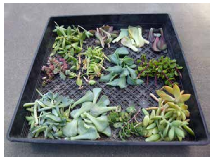
The most important step in propagating succulents is to allow the cut ends to callus or dry out before placing in the cactus mix.