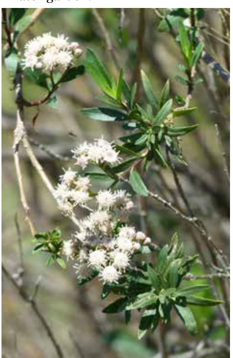
Baccharis salicifolia, Mule fat.

In the case of mule fat, its specific epithet—the second word in the Latin name—is salicifolia . This word is a combination of salici , referring to a willow ( Salix ), and folia , meaning leaves. Mule fat does indeed have willow-like leaves.