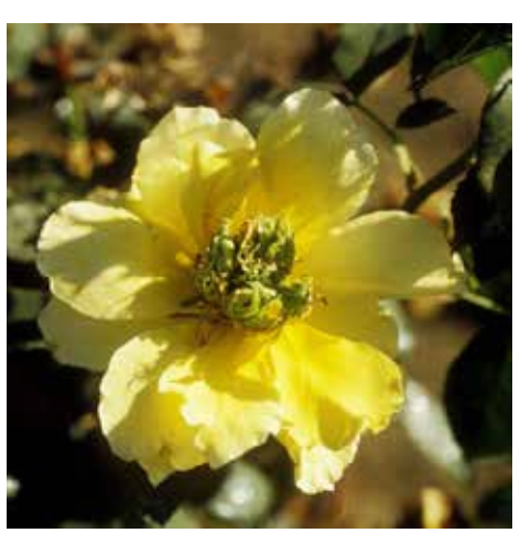
Rose with phyllody abnormality.

From your description, it sounds A like your plant has gifted you with phyllody, an odd flower formation in which flower parts are replaced by leaves and tiny branches. Phyllody can affect a flower's bracts, sepals, petals, pistils, and stamens, either with a partial or complete replacement of those rose parts. This condition occurs in many plants and for some reason is