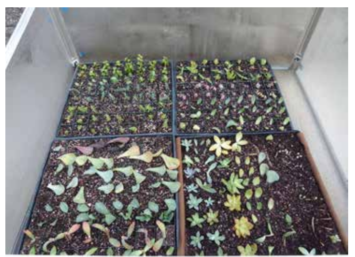
Succulent stem and leaf cuttings planted in clean cactus mix will soon sprout roots and form new plants to share with friends or use in creative arrangements.