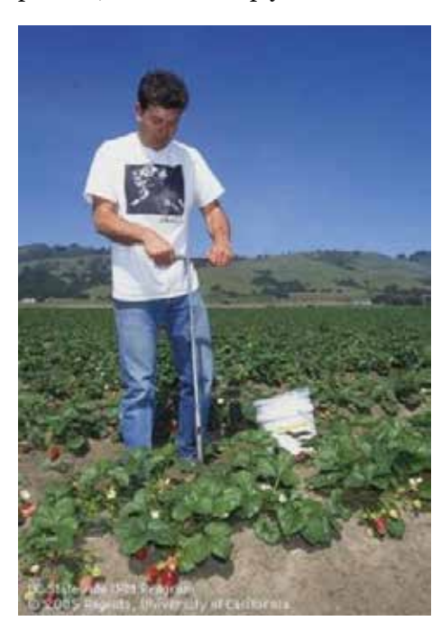
A soil tube, as shown above, can be used to collect soil for testing. Most home gardens will not require applications of phosphorus. In fact, adding it when it is not needed can actually cause harm.

We now know that phosphorus is rarely in short supply in non-agricultural gardens or landscape areas , largely because it seldom leaches. So you should never apply it without a lab soil test stating the soil is deficient in phosphorus. Our residential garden soils normally have the phosphorus they need. But the important truth I want the reader to remember here: excess phos phorus may cause harm .