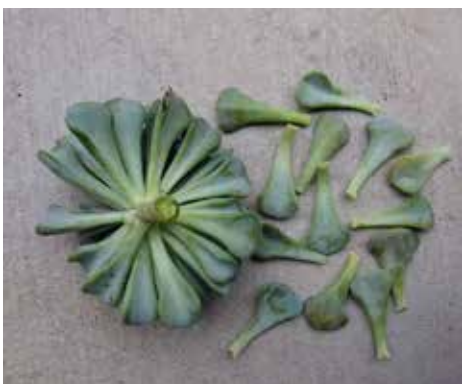
The top rosette and leaves plucked from the stem of an Echeveria that had gotten leggy provide material to make new plants.

It is not only possible, but also very easy, to create a whole new plant from a single succulent leaf. Simply pull or cut plump, healthy leaves from species like Crassula, Kalanchoe, Echeveria and Sedum, allow them to dry and form a callus layer over the wound, then set the cut ends in contact with a cactus medium in pots and keep only slightly moist. Within a few weeks to a couple months-depending on the temperature-roots and a tiny plantlet, as seen in the photo above left, will form from each leaf. Nighttime temperatures above 60° are most conducive to succulent root growth; roots will form at lower temperatures, but take longer.