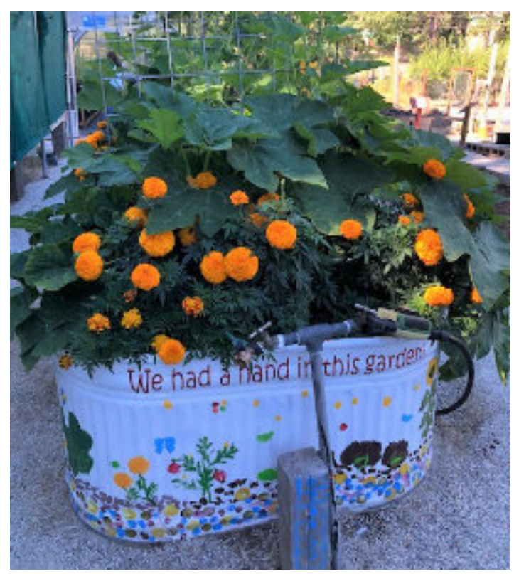
Youth program container.