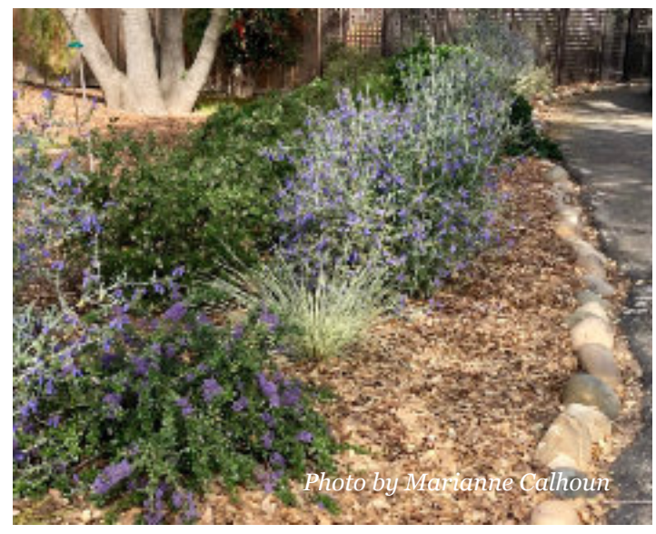
Along the driveway, native California lilacs (Ceanothus maritimus 'Valley Violet') and manzanitas (Arctostaphylos x 'Sunset') alternate with germanders (Teucrium fruticans 'Azureum') from the Mediterranean

If you're interested in welcoming birds, butterflies and bees, consider creating habitat with a hedgerow or a minihedgerow depending on space. Instead of planting a hedge of the same species, alternate three to five flowering shrubs that visually complement each other plus provide a variety of heights for wildlife. To best provide habitat, select shrubs that will attract birds, pollinators, and beneficial insects with flowers, fruit, and/or seeds during more than one season. Adding herbaceous plants (grasses, perennials, annual wildflowers, and bulbs) between woody shrubs will fill in the gaps when shrubs are young plus quickly establish low growing habitat.