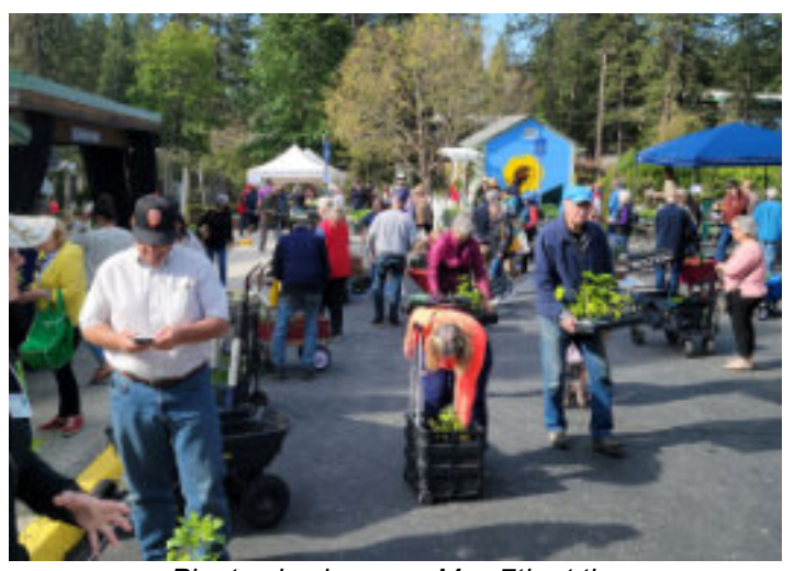
Plant sale shoppers May 7th at the Nevada County Demo Garden.