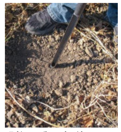
Taking a soil sample with an auger. Note that organic debris on the surface has been moved aside prior to taking the sample.

Office currently closed. Contact us through our <u>Facebook</u> page or <u>submit a question</u> electronically