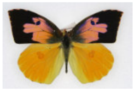
Male dogface butterfly. Photo credit: Colorado State University, Zerene eurydice, Creative Commons license CC BY-3.0

At any rate, these are long plant names that you can hum to yourself while on a long road trip or when you can't fall asleep at night. Enjoy!