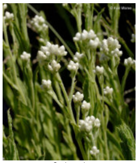
Cudweed, © 2008 Keir Morse. <u>CC BY-NC 4.0</u>