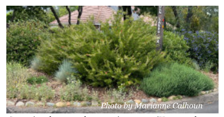
Screening the street, large native toyons (Heteromeles arbutifolia) alternate with California lilacs (Ceanothus thyrsiflorus 'Skylark') and manzanitas (Arctostaphylos x 'Sunset') plus spider flowers (Grevillea rosmarinifolia 'Scarlet Sprite') from Australia.

Homeowners in residential neighborhoods may be fascinated to learn that research found that <u>bird species doubled in the presence of hedgerows</u>, especially for migratory songbirds, and bird numbers tripled. You may already appreciate that birds help with pest control by feeding on unwelcome insects and rodents. Research also found that <u>enhancing habitat increases the number of beneficial insects</u>, including native bees, to aid in the pollination of nearby plants.