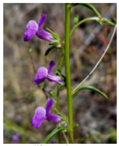
Wiry snapdragon. © 2020 Stacie Wolny <u>CC BY-NC 4.0</u>